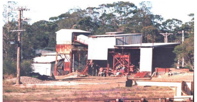
The old antimony processing plant (circa 1980)

No clean-up or remediation was done, and the site was eventually sold to a private owner.