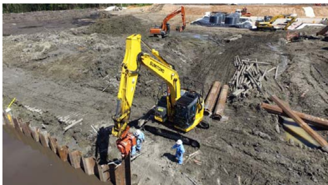
Installing a sheet pile wall to hold back the wetland water

It took 16 months to complete this technically complex project.