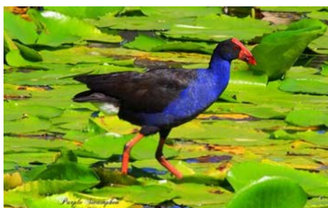
A Purple Swamp Hen

The wetland is increasingly becoming a destination for bird watchers. Some of the birds you can expect to see are shown below.