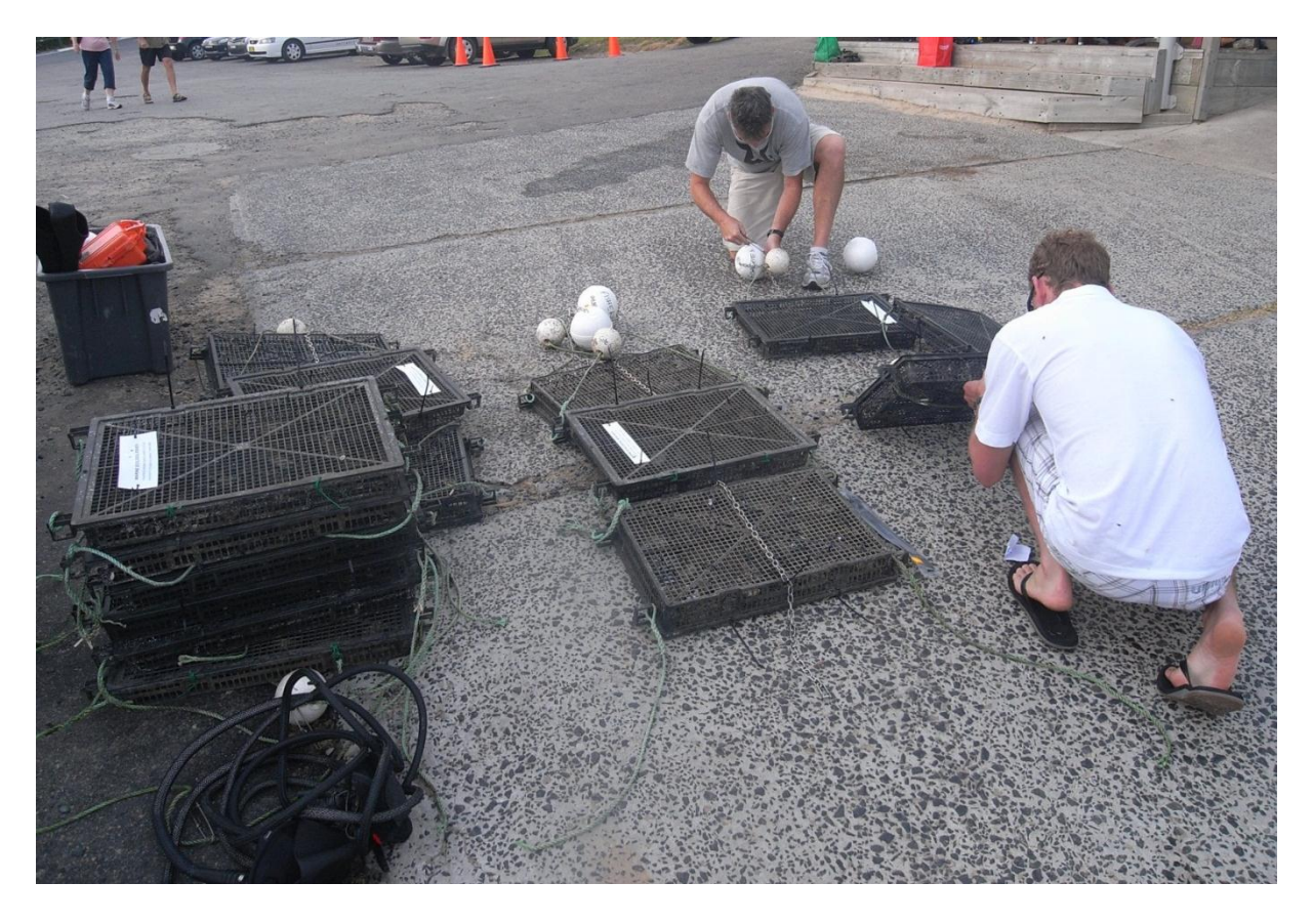
Figure 3: Preparing oyster trays for deployment.