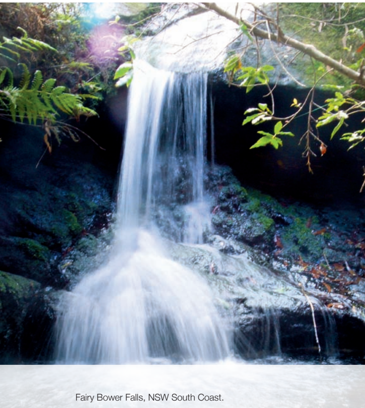
Fairy Bower Falls, NSW South Coast.

These partnerships also provide opportunities for economic growth to achieve stronger regional economies as directed in the State Plan.