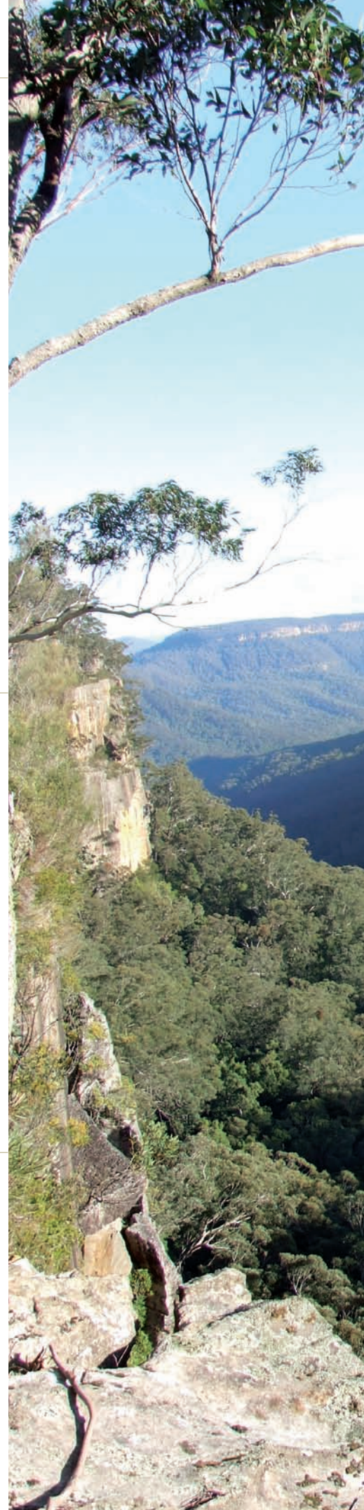
Fitzroy Falls, NSW South Coast.