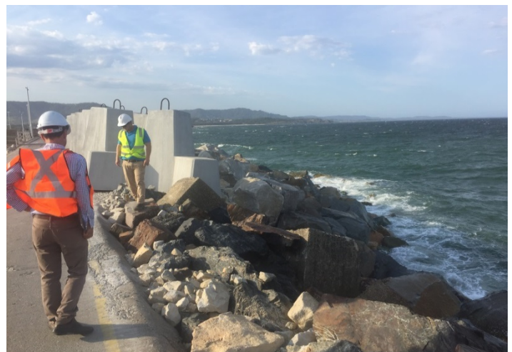
Coffs Harbour Northern Breakwater near Muttonbird Island. Temporary placement of 12 t Hanbars to make safe the eastern end of the Marina.

Repairs to the Boardwalk should be completed by the end of February, allowing an alternative access to the Northern Breakwater, when work recommences in mid-April, 2017.