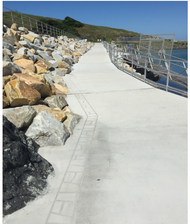
Marina Boardwalk extension to Muttonbird Island – Boardwalk will soon provide access

Muttonbird Island has been accessible over the summer holiday period, as work on the Coffs Harbour Northern Breakwater Upgrade ceased during the summer holidays.