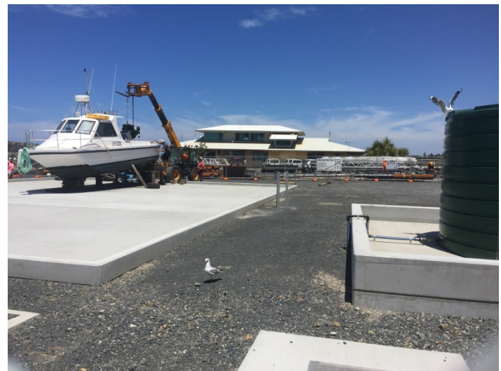
Boat Wash Down Facility

Establishing a new long-term boat maintenance facility takes time as it will need to be financially and environmentally sustainable.