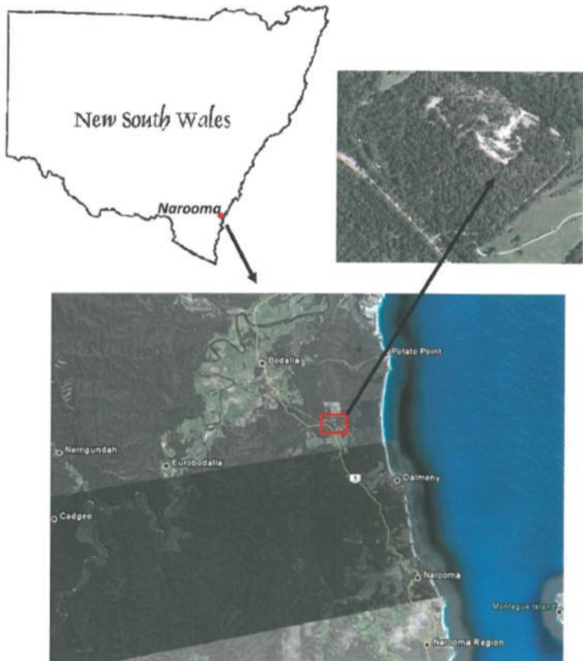
Figure 1. Location of Bodalla Quarry

Location of the quarry is shown Figure 1. Site map and other diagrams/photos are provided in Appendix A.