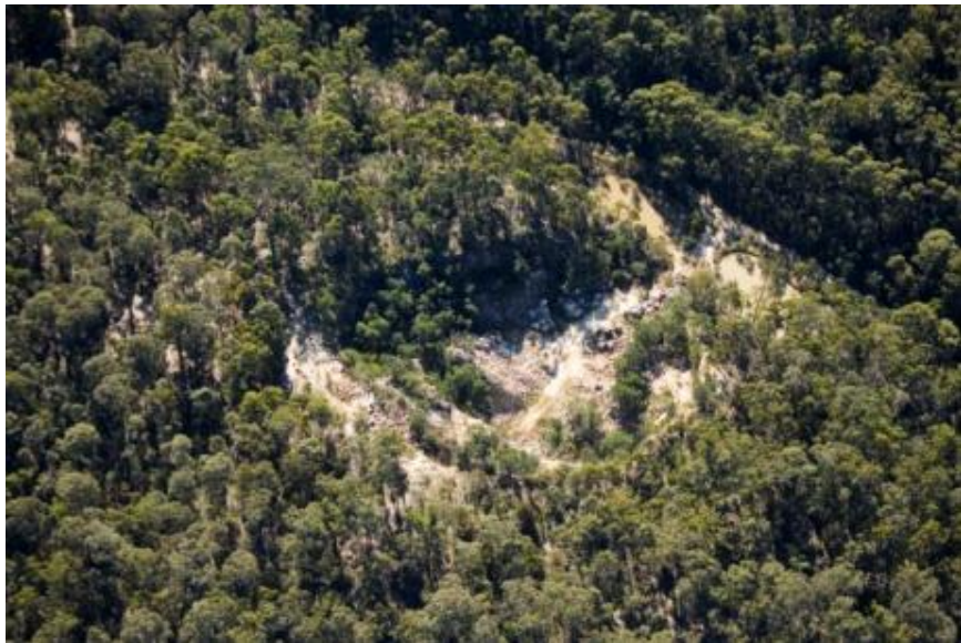
Aerial view of Quarry