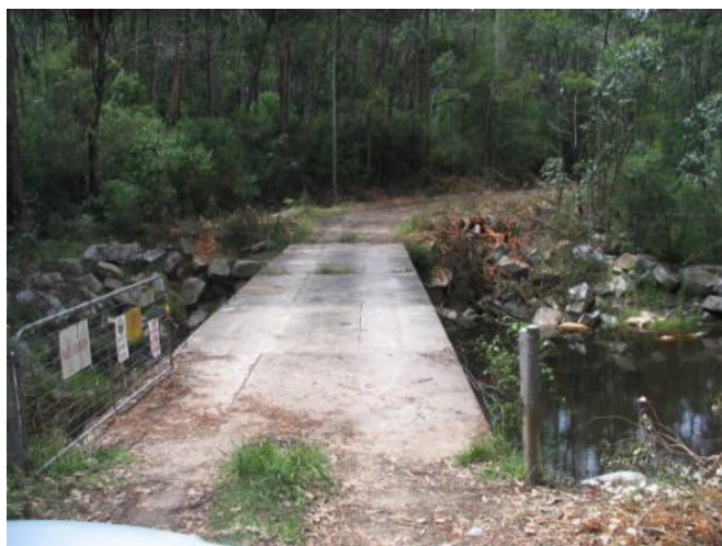
Access gate and bridge