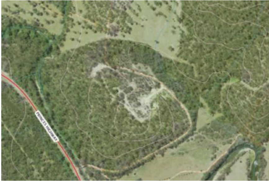
Contour map of Quarry area.