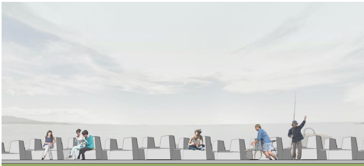
Artist impression of the upgraded breakwater looking north toward Little Muttonbird Island

Stage 3 consists of raising the crest level over 300m, placement of a rock toe berm and concrete Hanbars on the face to reduce the frequency of wave overtopping and damage to infrastructure at the more exposed eastern end of the breakwater opposite the Marina.