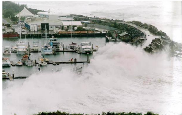
Storm waves attacking the northern breakwater and marina (May 1999)