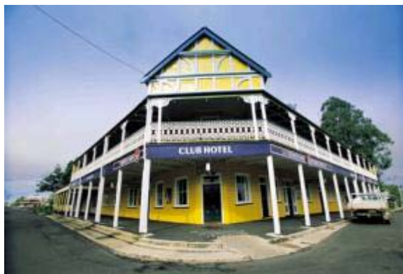
Figure 2 Historical Hotel on Main Street of Coraki

This Plan of Management and the Landscape Master Plan for Coraki recognise the historical importance of the Coraki Foreshore Crown Reserve. The Master Plan uses "storyline" features to identify the locations of historically significant sites in the reserve area. As the Master Plan has a greater scope than the reserve Plan of Management the storyline feature expands to include the main street. The Master Plan integrates the historical buildings on the main street with the foreshore reserves. This is through the storyline features and street landscaping themes which provide a seamless entry from the main street to the foreshore reserve.