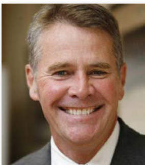
The Hon. Andrew Stoner MP

I encourage you to read the White Paper and have your say on the legislative proposals. The NSW Government values the input of local communities and key stakeholders, and all submissions will be considered when developing the new Crown lands legislation.