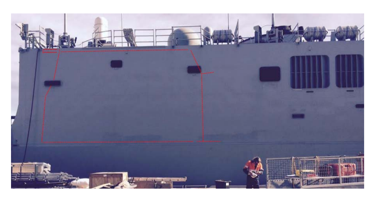
Photo 1: This photo of a similar vessel to the Ex-HMAS Adelaide demonstrates the location of the section of the starboard hanger structure that has separated from the vessel. It is marked in red.