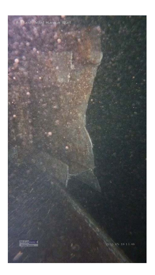
Photo 3: This photo shows the buckled starboard hanger side plating forward to the parted structure.