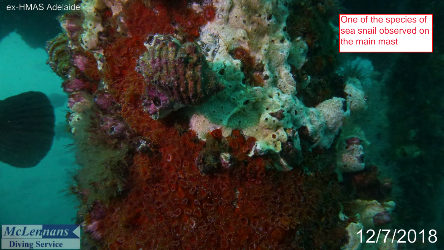
One of the species of sea snail observed on the main mast