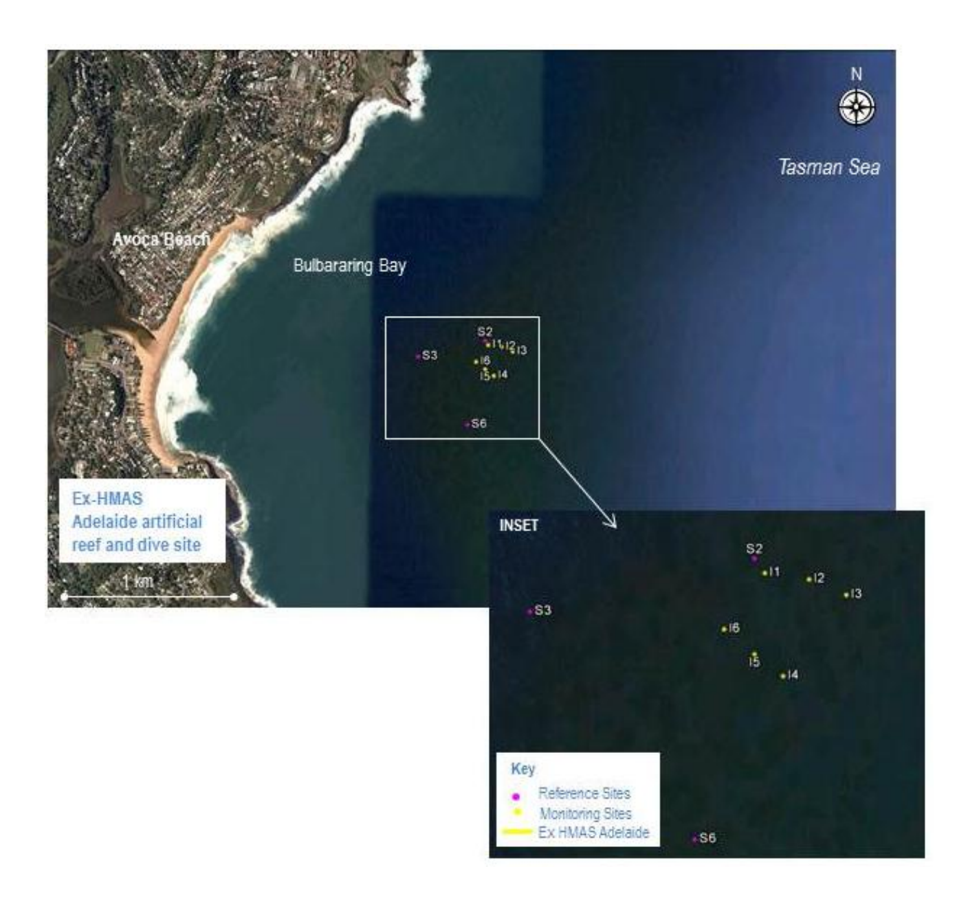
Figure 2: Locations of Marine Sediment Quality Sampling Sites.

Samples were collected from the same sites as those pre-determined by Worley Parsons in the earlier (one month post-scuttling survey). These included a total of nine samples with three reference locations (S2, S3 and S6) and six monitoring locations (I1, I2, I3, I4, I5 and I6). For continuity, the same location ID's have been used as the previous survey. Locations and GPS positions of the nine sampling locations are given in Table 1 and Figure 2 . Three samples were also collected from the bow, midship and stern sections from within the hull of the ship for analyses of lead content ( Figure 3 ). Samples had not been collected from these locations in previous surveys as no sediment had accumulated within the hull at that time.