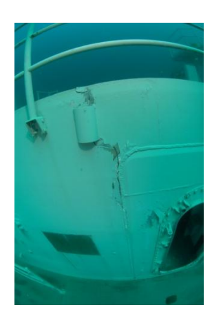
Crack # 1 - side view

Crack # 2 on 02 Deck starts from the diver access hole immediately forward and to starboard side of elevator shaft. It runs from aft / port side of access hole and continues to midship.