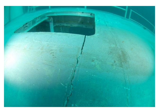
Crack # 2 - top view

Crack # 2 on 02 Deck starts from the diver access hole immediately forward and to starboard side of elevator shaft. It runs from aft / port side of access hole and continues to midship.