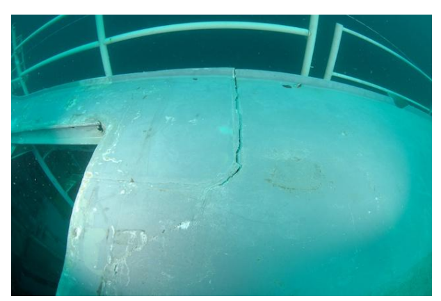
Crack # 3 - top view

Crack # 3 runs approx 0.5m aft of the same diver access hole.