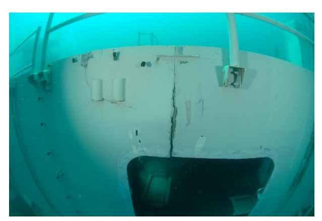
Crack # 4 - side view

Crack # 4 is the larger crack running vertically down to the dive access hole into the STIR equipment room on the starboard side of ship. The smaller (curved) crack shown in the photo below is a continuation of Crack # 3.